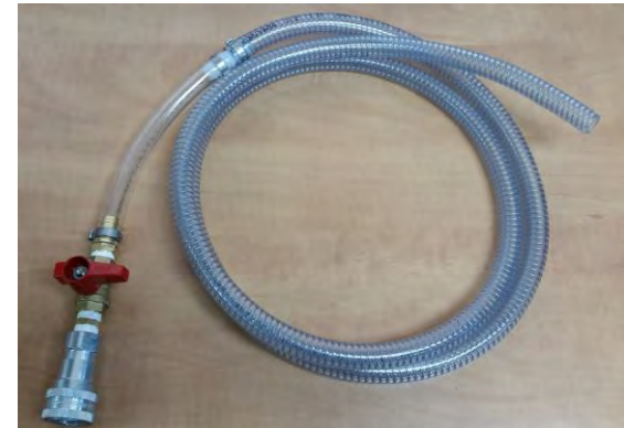
Part# 7016 3/8" Clear Hose **This replaces the Black Hose**