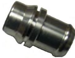
Part# 7976-B Quick disconnect for Audi/Volks