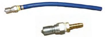
Part# 7107 5/16" Hose Adapter