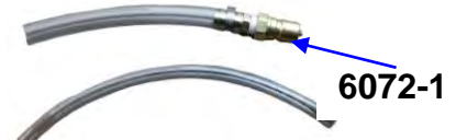
Part # 7012 1/2" and 3/8" Clear Hose Adapter