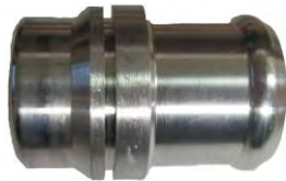
Part# 7975-B Quick disconnect for BMW