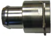
Part# 7976-A Quick disconnect for Audi/Volks