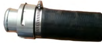
Part 7977-C as set Quick disconnect for Ford Diesel