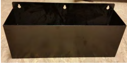
Part# 2009 RCS Fitting Box