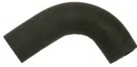
Part # 7008-90 1 3/4 90° Hose