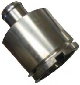
Part# 7977-A Quick disconnect for Ford Diesel