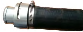
Part 7976-C as set Quick disconnect for Audi/Volks