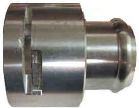
Part# 7975-A Quick disconnect for BMW