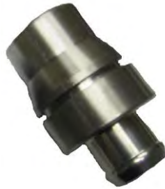
Part# 7977-B Quick disconnect for Ford Diesel