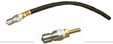
Part# 7106 3/8" Hose Adapter