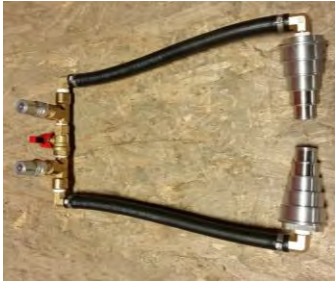
Part # 7013 (1 per RCS 540) 5 Step Loop Hose