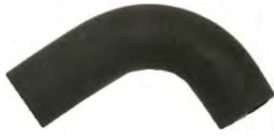
Part # 7009-90 1 1/2 90° Hose