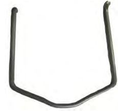
Part# 7977-D Hanger for Ford Diesel