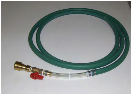
Part# 7016-2 1/2" Green Hose