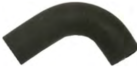
Part # 7010-90 1 1/4 90° Hose