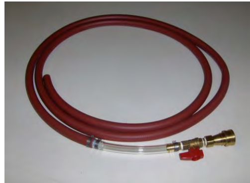
Part# 7016-1 1/2" Red Hose