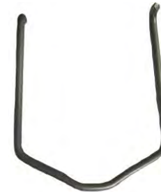
Part# 7976-D Hanger for Audi/Volks