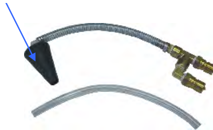
Part # 7015 12" long 3/8" Clear Hoses and One Rubber Cone Adapter