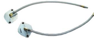
Qty. 2 Part # DFS 910-22 Cummins ISX15 2011 and newer