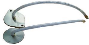
Part # DFS 910-19 & DFS 910-19-2 Cummins ISX14 2007-2010 Adapter