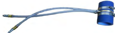
Part# DFS 910-44-1 Cummins Adapter 2"