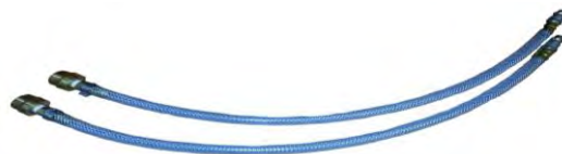
Part# DFS 910-45-1 Volvo (2)