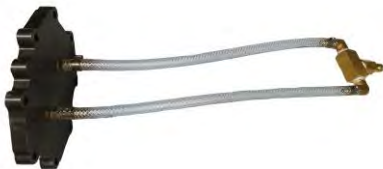
Part# DFS 910-42 Mercedes MBE4000 2006 and newer