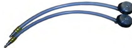
Part# DFS 910-41 Pacar (2)