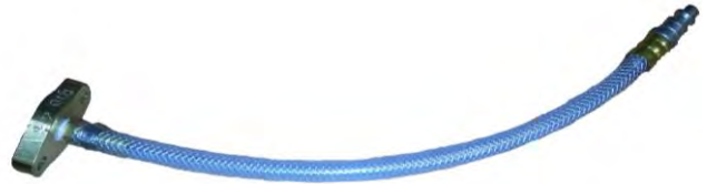
Part# DFS 910-43-1 Volkswagen (2)