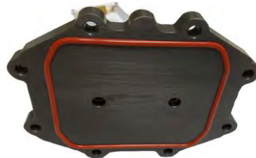
Part# DFS 910-42 Back side of plate