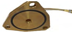
Part# DFS 910-37 International