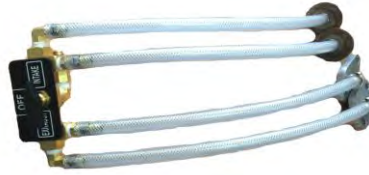
Part# DFS 910-26 International