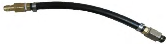
Part# DFS 910-2 Ford/Cummins Exhaust Adapter