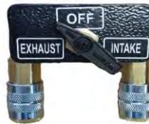
Part# DFS 910-5A Diverter Valve with Quick Connects