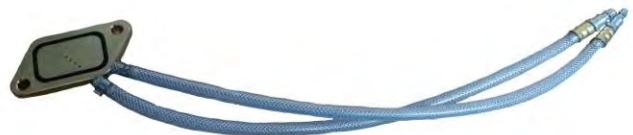
Part# DFS 910-34 Duramax Diesel 6.6L