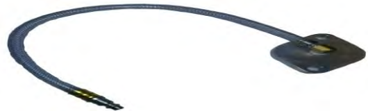
Part# DFS 910-39 Oval Fitting / Hino Adapter