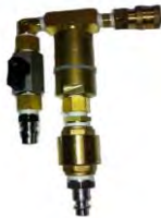
Part# DFS 910-5 Induction Sprayer