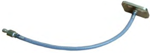
Part# DFS 910-34-1 Duramax Diesel 6.6L