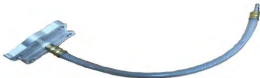
Part# DFS 910-40 Hino Adapter