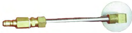
Part# DFS 910-4 Dodge Cummins Exhaust Tube -Optional