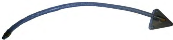
Part# DFS 910-38 International DDT Maxforce 7.6L (2)