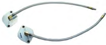
Part# DFS 910-22 Cummins ISX15 2011 and newer (2)