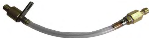
Part# DFS 910-7 Duramax Turbo Boost Senser Adapter-Optional