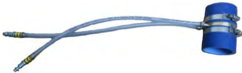
Part# DFS 910-44 Cummins Adapter 2 1/4"