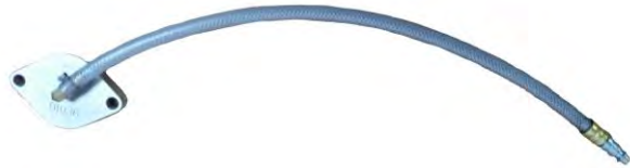
Part# DFS 910-36 Mercedes