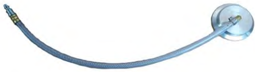
Part# DFS 910-M8-1 Volvo/Mac EGR Adapter