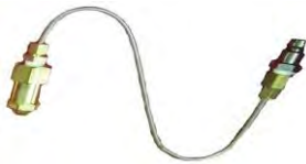
Part# DFS 910-3 S-Hook Sprayer