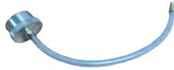
Part# DFS 910-M8-2 Volvo/Mac EGR Adapter