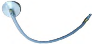
Part# DFS 910-M8-3 Volvo/Mac EGR Adapter