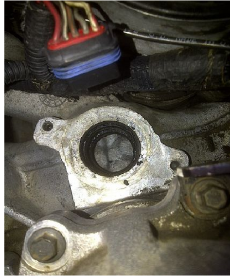
After service was completed