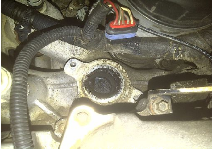
Before service has been preformed