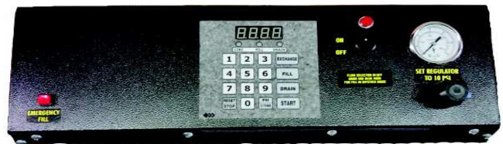
Flow Indicator Light